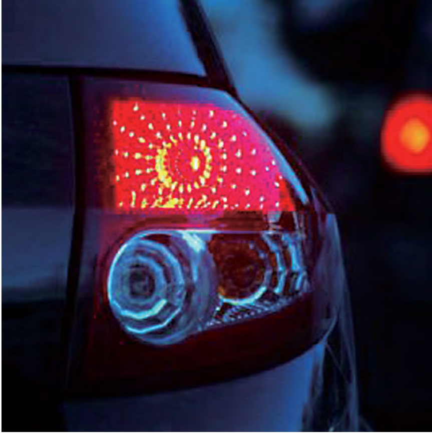
AUTOMOTIVE LED BRAKE LIGHTS