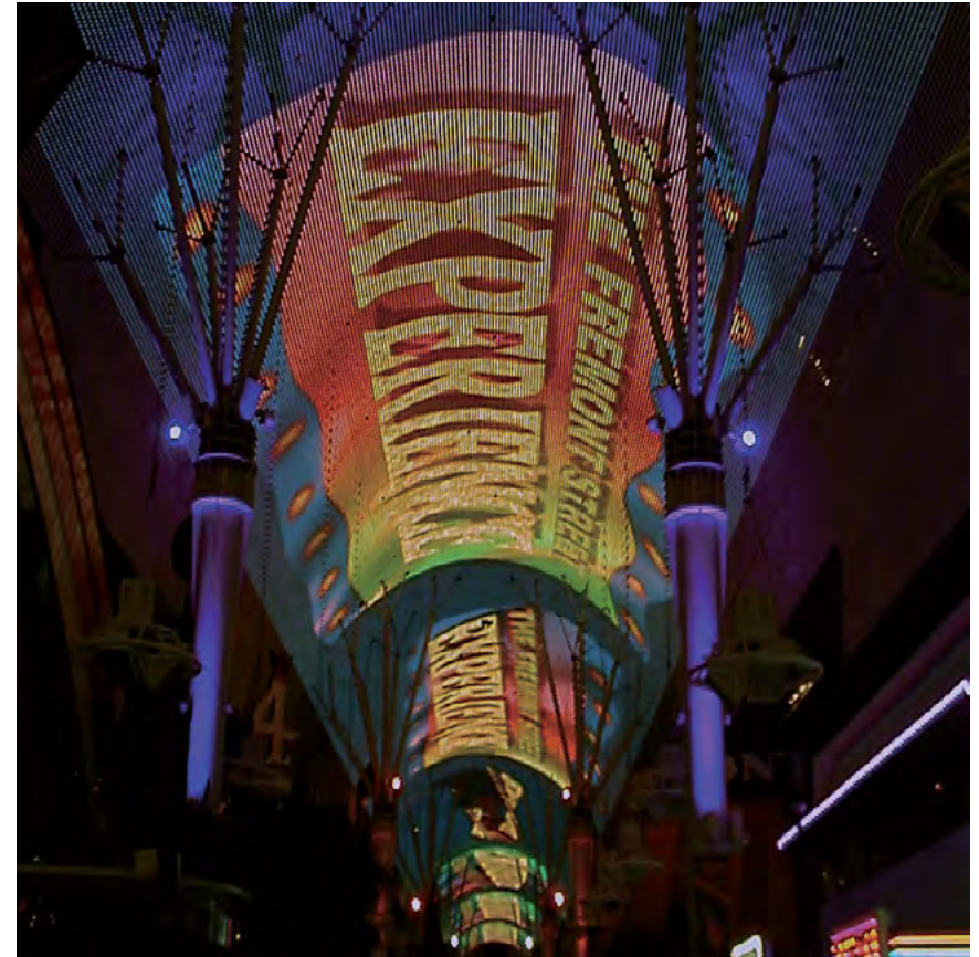
THE FREMONT EXPERIENCE ARCHITECTURAL CEILING DISPLAY LAS VEGAS, NEVADA