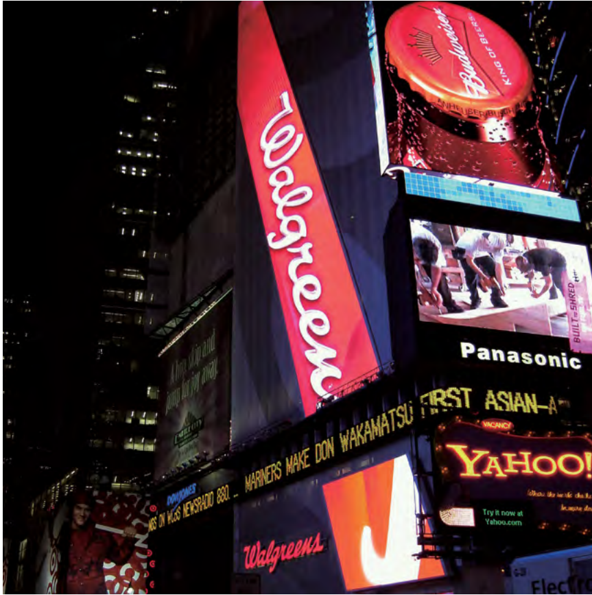
WALLGREENS LED VIDEO DISPLAY TIMES SQUARE, NEW YORK