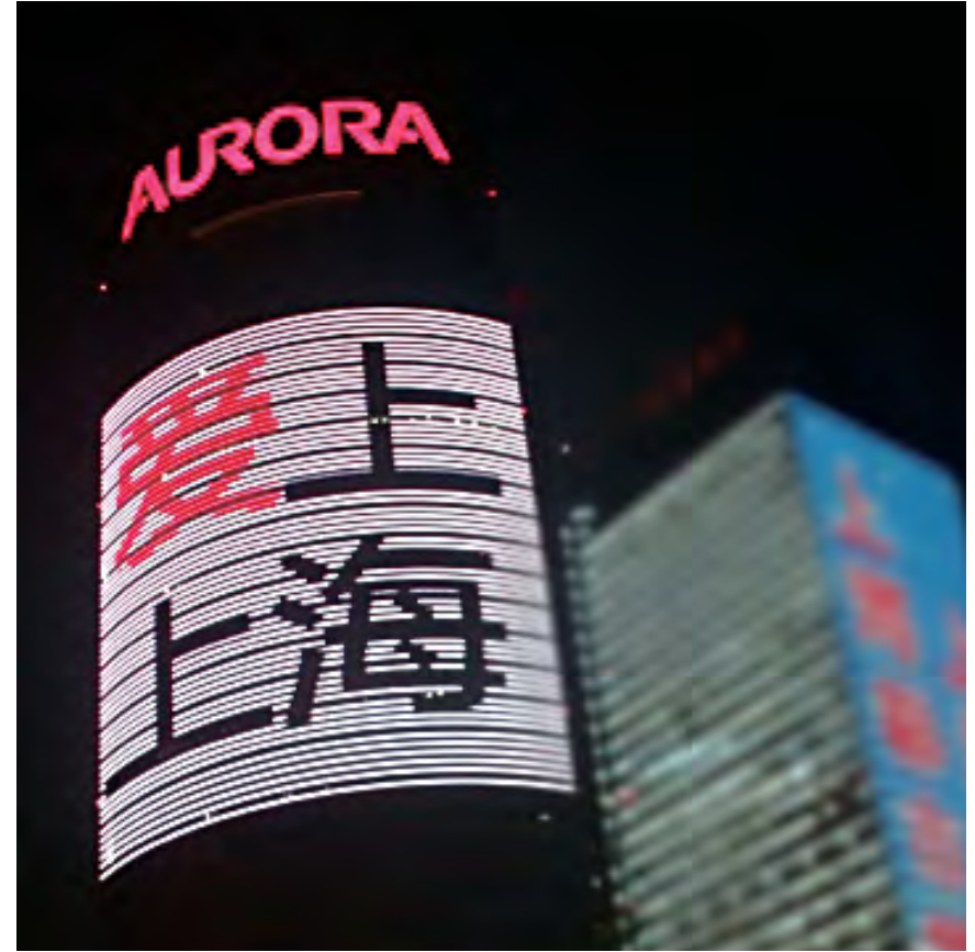
AURORA 37-STOREY BUILDING LED VIDEO DISPLAY SHANG HAI, CHINA