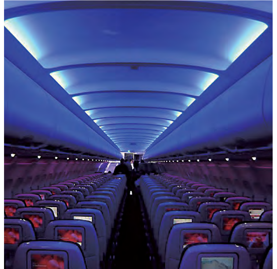
COMMERCIAL AIRLINE INTERIOR LED LIGHTING