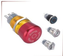
LAS1-AGQ系列 安装孔径: \Phi 19