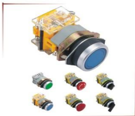
LAS0系列B型 安装孔径: \Phi 22