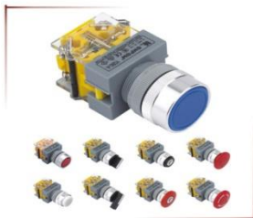
LAS0系列Q型 安装孔径: \Phi 22