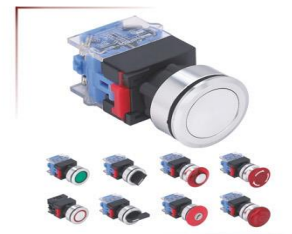
LAS0系列K30型 安装孔径: \Phi 30