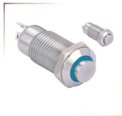
GQ12系列C型 安装孔径: \Phi 12