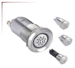
GQ蜂鸣器 安装孔径: \Phi 16,19