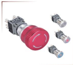
LAS1-BGQ系列 安装孔径: \Phi 19