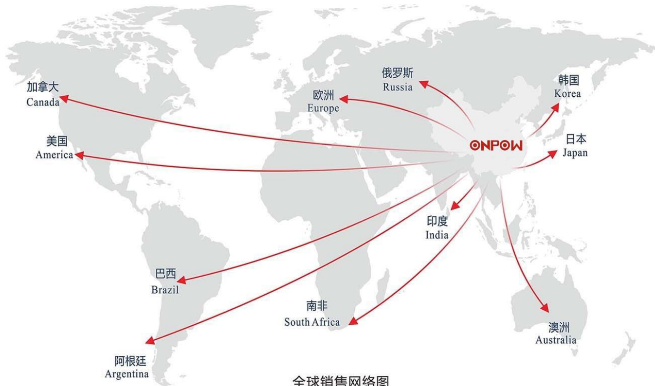
全球销售网络图 Global sale network chart

We are looking for agents from other countries, please contact us if you are interested.