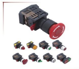
HB22系列 安装孔径: \Phi 22