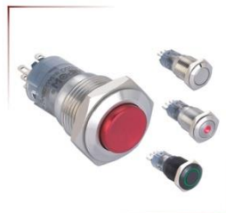
LAS2GQ系列 安装孔径: \Phi 16