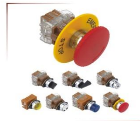
LAY3系列 安装孔径: \Phi 22