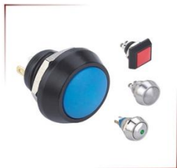
GQ12系列 安装孔径: \Phi 12