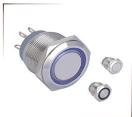
微行程按钮 安装孔径: \Phi 19,22