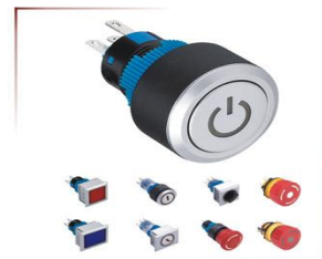
LAS1系列 A22型 安装孔径: \Phi 22