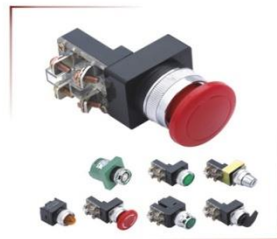
HB25(30)系列 安装孔径: \Phi 25, 30