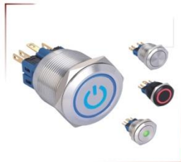
GQ22,25,28,30 \Phi 22,25,28,30