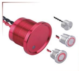
压电陶瓷开关 \Phi 16,19,22