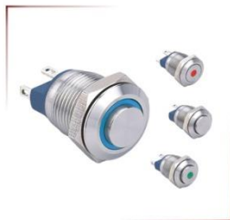
GQ12系列A型 安装孔径: \Phi 12