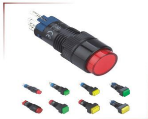
LAS2,3,4系列 \Phi 12, 10, 8