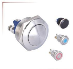
GQ19系列 安装孔径: \Phi 19