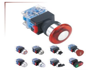
LAS0系列 L/K型 安装孔径: \Phi 22