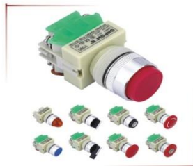
Y090系列 安装孔径: \Phi 22