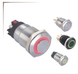
LAS1GQ系列 安装孔径: \Phi 19