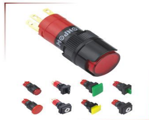
LAS1系列 安装孔径: \Phi 16