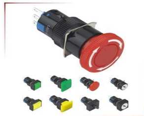
LAS1系列A型 安装孔径: \Phi 16