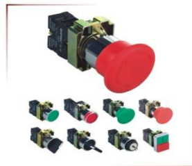
HBV5系列 安装孔径: \Phi 22