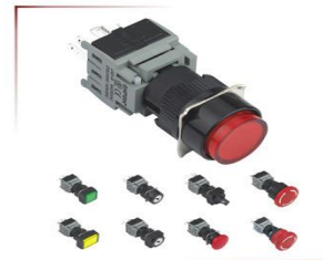
LAS1系列 B型 安装孔径: \Phi 16