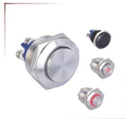
GQ16系列 安装孔径: \Phi 16