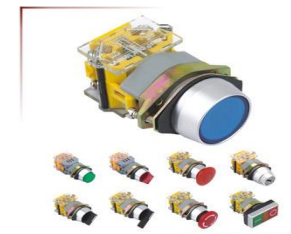
LAS0系列A型 安装孔径: \Phi 22